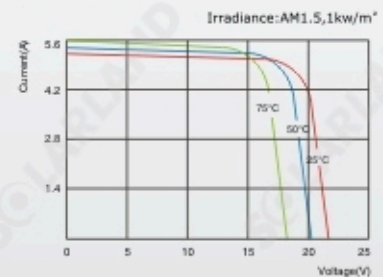
SLP085-12 I-V Curves