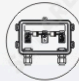
Junction Box Top View (Lid Open)