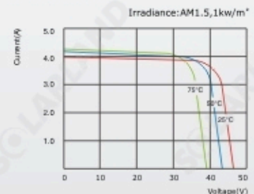
SLP130-24 I-V Curves